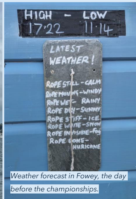
Weather forecast in Fowey, the day before the championships.

Otherwise, the National Championships were the usual lovely combination of competition on the water and camaraderie (and catering) on shore. Oh, and an added bonus while sailing back was the sighting of more than one pod of dolphins, which came up and played around the boat for a while and then slipped away into the Channel.