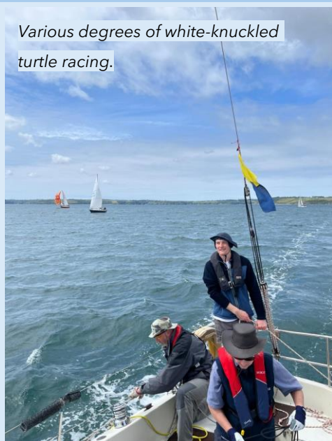
Various degrees of white-knuckled turtle racing.

We had a total of four races, all of which required careful course planning, perfect sail setting, exact seal sausage placement of crew and steady nerves necessary for white-knuckled turtle racing. Among all that excitement was time for a short Cornwall excursion to St. Mawes for swimming and ice cream.