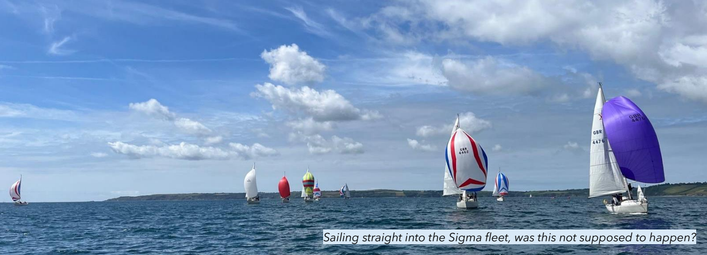
Sailing straight into the Sigma fleet, was this not supposed to happen?

After an interesting start, the Ballad fleet moved its way along the course. The wind held steady but certainly it required very careful moving about the boat - a day which inspires the term "white-knuckled turtle racing". The concurrent Sigma race provided some spectacular views of a hoard of spinnakers bearing downwind, with everyone making space and finding elegant solutions to get around each other.