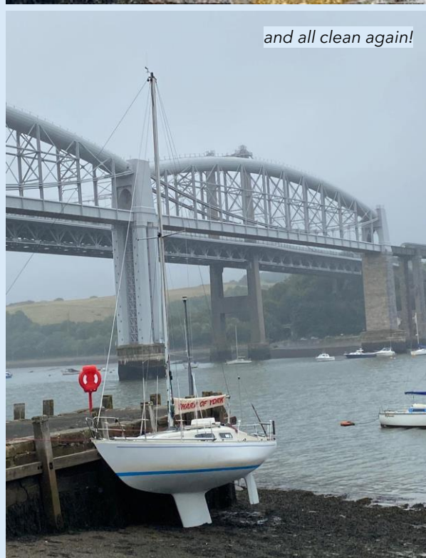
and all clean again!