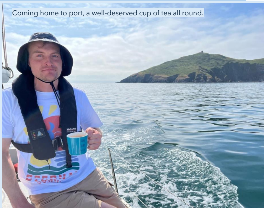
Coming home to port, a well-deserved cup of tea all round.

After about 8 hours, we pulled around Rame Head and made ourselves a cup of tea. Things stayed interesting till the end though, with some tricky shipping traffic manoeuvring needed to get us home safe.