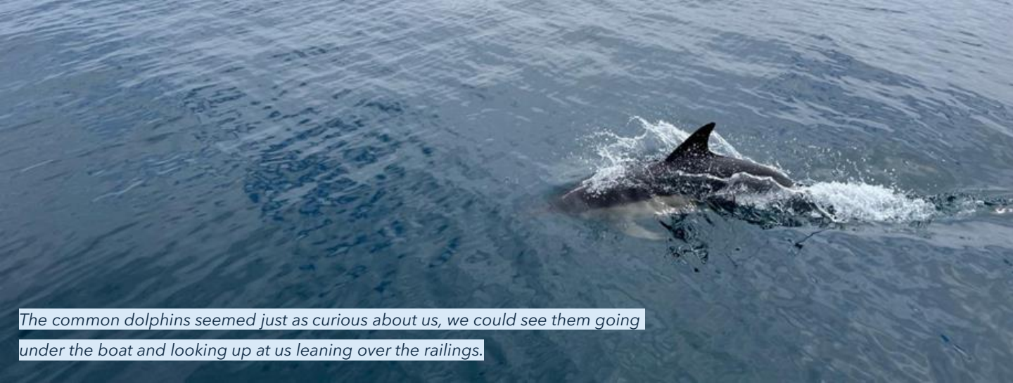
The common dolphins seemed just as curious about us, we could see them going under the boat and looking up at us leaning over the railings.

After getting all racing that was to be had out of the little wind, the boats set off for their separate ports. Duchess had a long sail ahead, with help from both wind and motor, being accompanied by Summertime and Poppin. In between lounging around in the sun letting "Otto" do his job, there was quite a bit of wildlife to watch.