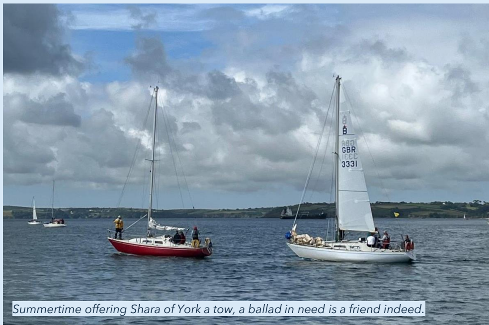
Summertime offering Shara of York a tow, a ballad in need is a friend indeed.