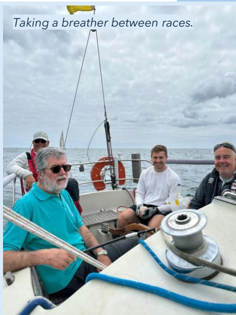
Taking a breather between races.