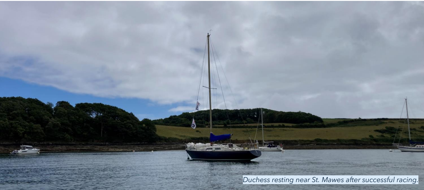
Duchess resting near St. Mawes after successful racing.

I have been sailing on Duchess at the Nationals since 2007, I think, so that is about 15 or 16 events. During that time, my increasingly unreliable memory believes that we have pretty consistently been in the top three or four for most of the races - or at least that is how I like to remember it! And, on occasions, we have even managed to lead the fleet for at least some of the time. A couple of races stick out: Dartmouth in a heavy blow, when we unfortunately completely wrapped the spinnaker around the forestay and had to retire; and one year at Fowey when we were in the lead at the wing mark, but then fell into a wind hole that was avoided by Shara and normal service was resumed.