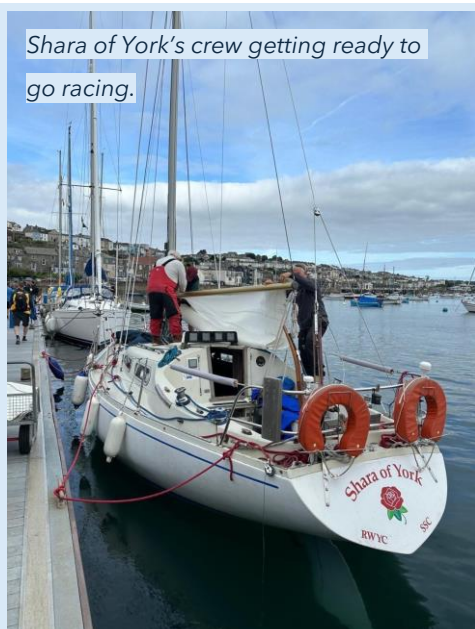
Shara of York's crew getting ready to go racing.